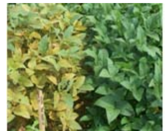
The new rust-resistant TGx 1835-10E (right) compared with a local susceptible soybean variety (left).

http://www.iita.org/cms/details/news_feature_details.aspx?articleid=2517&zoneid=342