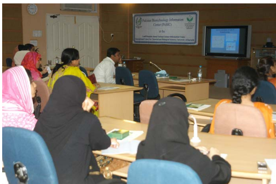
Participant of the lectures